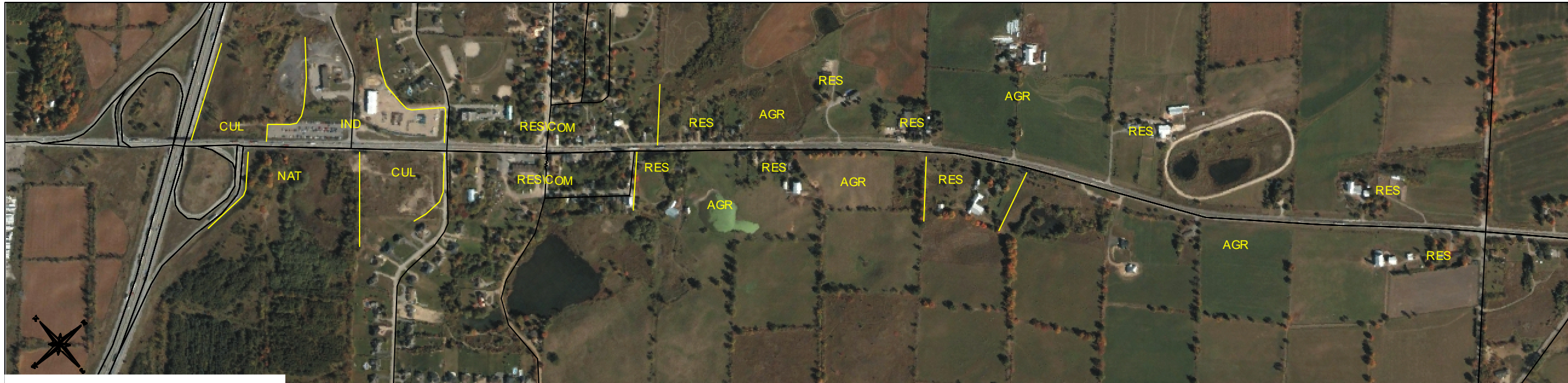
Air Photo 1